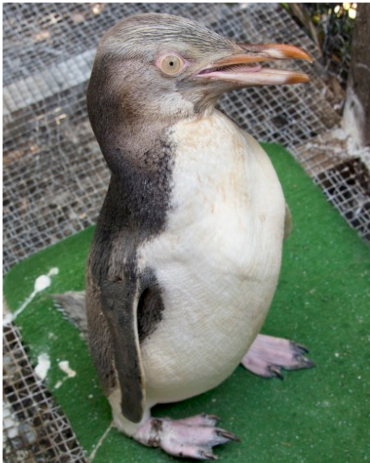
Foot injury of a juvenile Yellow-eyed penguin