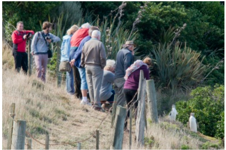
People crowd around a parent Yellow-eyed penguin trying to feed its chick

We need help now for the penguins to protect them from the uncontrolled public access that is costing chicks' lives, ensuring a plentiful food source for the penguins at sea, we need funding to rehabilitate those penguins that are in trouble, funding to publish our work and support from all who wish to see penguins in the future on the South Island.