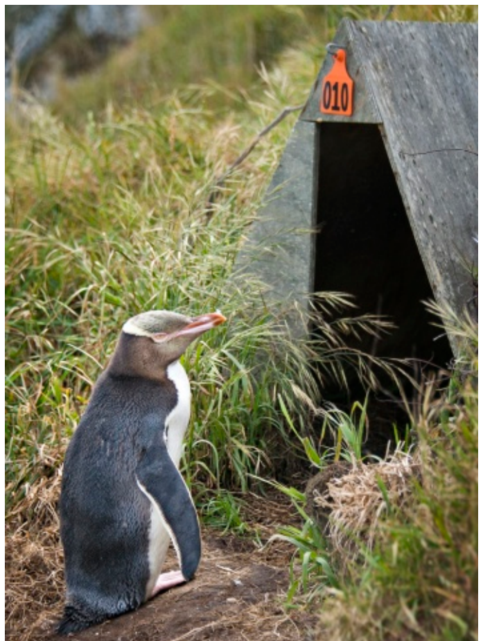
Adult Yellow-eyed penguin in front of its nest box