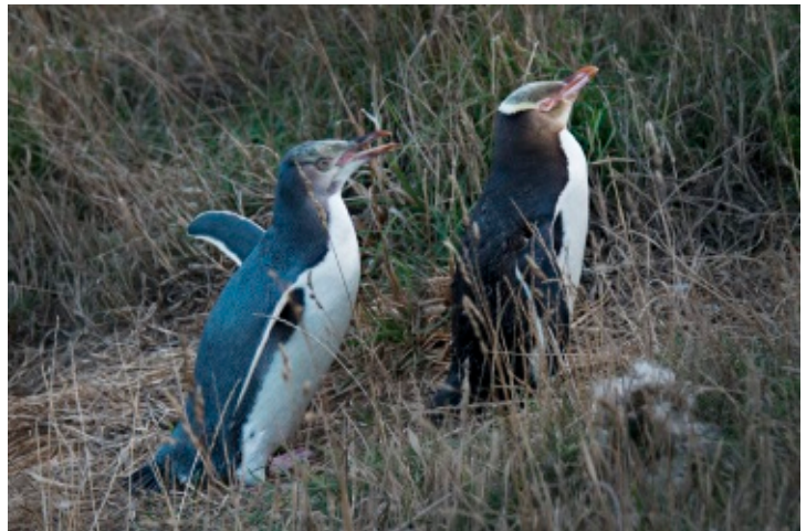
Adult and chick Yellow-eyed penguin